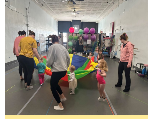
The Saturday morning Tiny Tots class had lots of fun during parachute play!