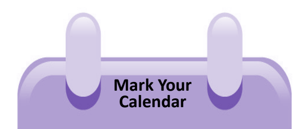
No Class: October 31 Open Studio: November 1 and 3 Fall Tuition Payment Due: November 7 Drop and Shop: November 5 Fall Break: November 21 - 25 Costume & Picture Fee Due: December 1 Christmas Cabaret: December 17 at 10:30am at Ed-Co High School Gym Winter Break: Dec. 18 - Jan. 8, 2023 Spring Session Begins: January 9, 2023 Spring Tuition Payments Due: Jan. 9, Feb. 6, March 6