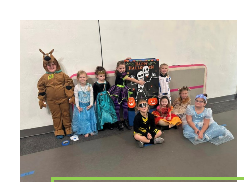
Halloween Dance Party on October 29th