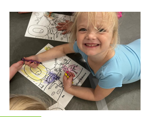
Dancers during School Spirit Week